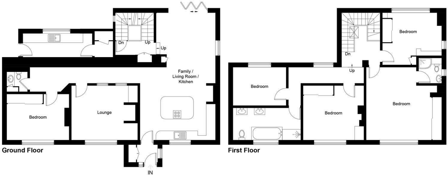
Illustration for identification purposes only, measurements are approximate, not to scale. Fourlabs.co © (ID1242551)

Approximate Gross Internal Area = 192.6 sq m / 2073 sq ft